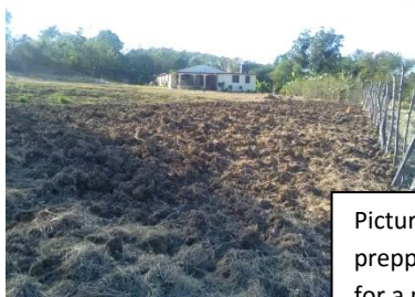
Picture of land that is being prepped to build concrete forms for a new reservoir this month.

The church in Pernal is currently working to build a new 20,000 gallon reservoir on their property adjacent to their orphanage. This concrete reservoir will supply water not only for their orphanage, but school and church. This will be a welcome addition during the years